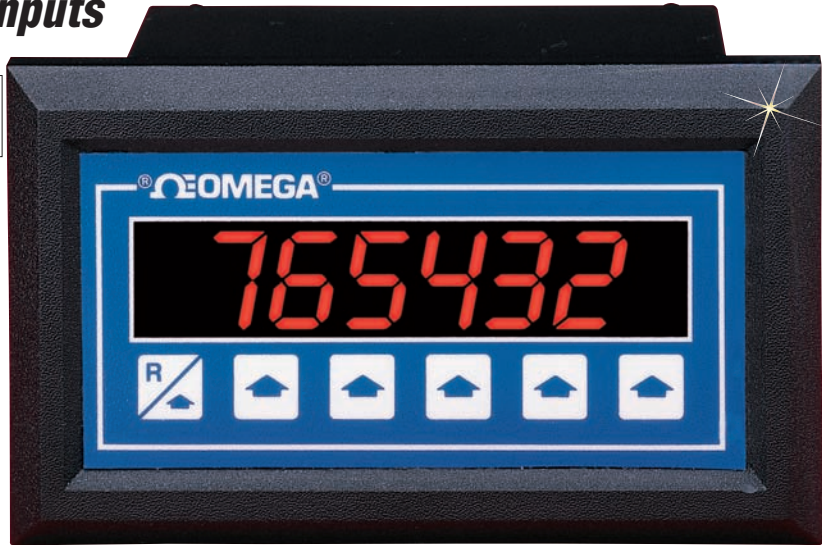
DPF66 1/8 DIN, $420, shown actual size.

With the DPF66, the user can toggle between rate of flow and total flow (6-digits) from the front panel. The rate display is selectable for units per second, minute, or hour, and the totalizer integrates in the same engineering units. The DPF65 displays just total flow, while the DPF64 only displays rate of flow.